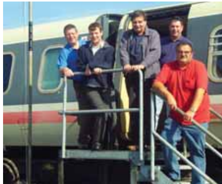
Members of the South Cheshire ARS on the steps of the Advanced Passenger Train that held their special event station.