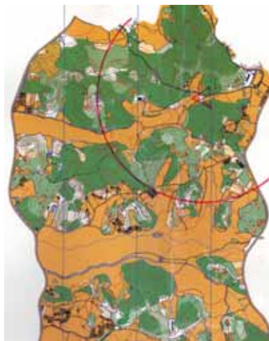
Part of the map used for the 144MHz race. The contour interval is 5m and the red circle is 750m from the start triangle. The colours are explained in the text.