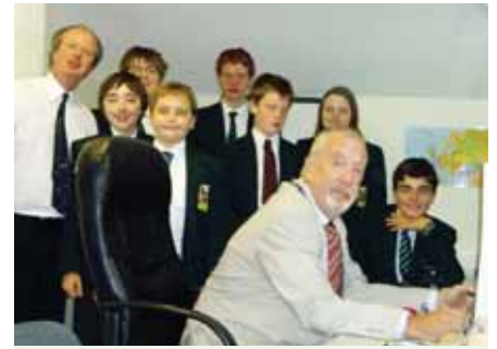
Silcoates School ARC.

The young operators at Silcoates School ARC