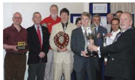
Some of the award and trophy winners at the 2008 AGM.